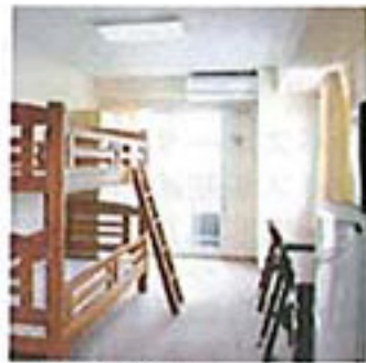
Full view of the room