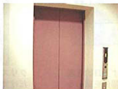
Elevator (for women)