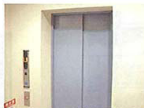
Elevator (for men)