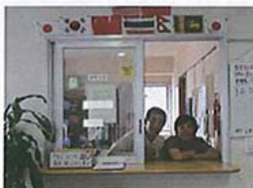
Regular cleaning (image)