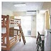
Full view of the room