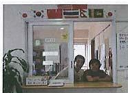
Regular cleaning (image)