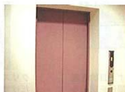
Elevator (for women)