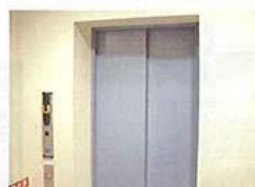
Elevator (for men)